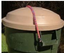
Secure lids help prevent birds from getting into cans and scattering trash.